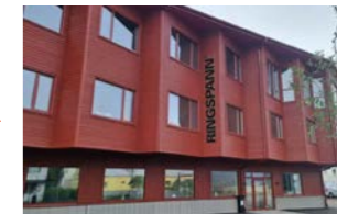
RINGSPANN Nordic AB, Sweden