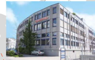
RINGSPANN AG, Switzerland