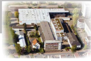
RINGSPANN GmbH, Germany Headquarters and Plant Freewheels

Power Transmission Clamping Fixtures Remote Control Systems