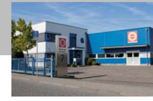
RINGSPANN RCS GmbH, Germany Plant Remote Control Systems