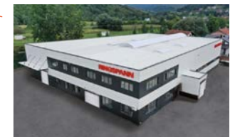
RINGSPANN Bosanska Krupa d.o.o., Bosnia and Herzegovina