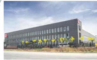
RINGSPANN Power Transmission (Tianjin) Co., Ltd., China