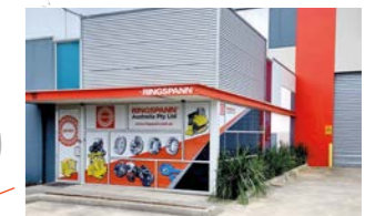
RINGSPANN Australia Pty Ltd, Australia