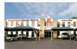
RINGSPANN South Africa (Pty) Ltd., South Africa