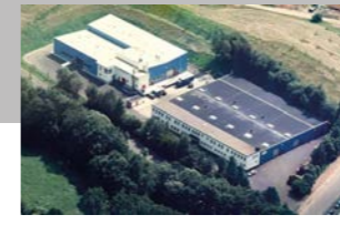
RINGSPANN Kempf GmbH, Germany Plant Cardan Shafts