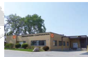
RINGSPANN CORPORATION, USA